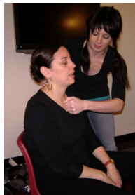
Sternal Rub

2. Call 911 & advise "I have someone who is not conscious & not responsive."